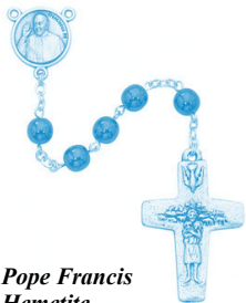
Pope Francis Hemetite

The Bookstore is open today! October is the month of the Rosary. Come into the store and check out the vast assortment of rosaries we offer.